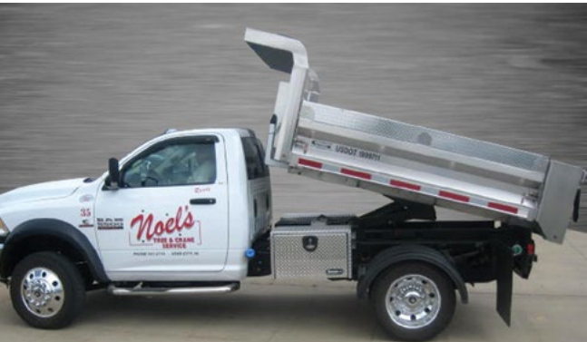
*Hoist not included